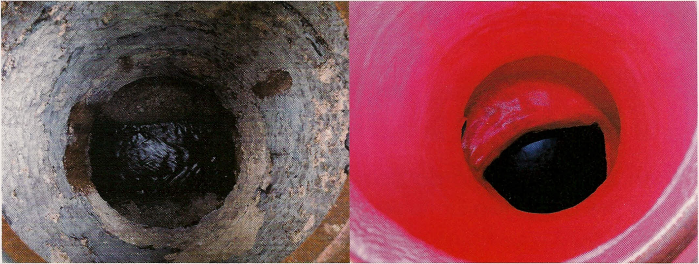
JEA contracted with CCI Spectrum to reline some 6,500 manholes as part of its sewer rehabilitation project. Using the SpectraShield process, only about 500 manholes are left to be relined. Here, the before and after is shown.